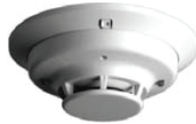
i 3 Series Detector