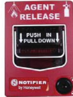
NBG - 12LR Releasing Station