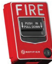
NBG - 12LX Releasing Station