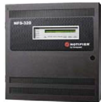
NFS - 320 Releasing Control Panel